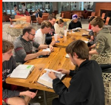
We studied the Gospel of Mark together in Talley Student Union on Tuesday Nights