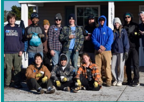
On a chilly Saturday in January a group of CCF students from UNCW helped serve with the Cape Fear Habitat for Humanity, our assignment was mainly to lay down sod in a recently built home as it was nearing completion.