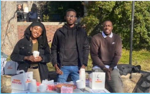
Our student leaders were excited about our outreach Valentine's service event for UNC's campus where we gave away goodie bags and hot chocolate.