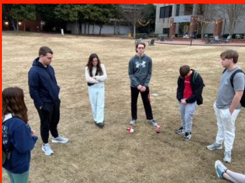
At the beginning of the spring semester, some of our students went on a Prayer Walk around campus. Here we are outside of Witherspoon Student Center